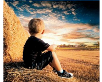
AgVantage 2020 National "Live Streamed" Conference - June 17-18, 2020

Thank you for your continued business. In our 44 th year of business, I realize you have many choices for software providers. I will do my best, each and every day, to assure your happiness in your choice of AgVantage® Software as your Agribusiness Accounting system.